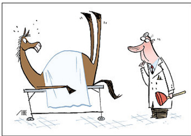
(Bob Staake for The Washington Post)

Given that we don't have as much space on this page for entries as we used to, we're going to expand the field a bit, as suggested by Horse Name Obsessive Russell Beland, who suggested the grandfoals contest to begin with.